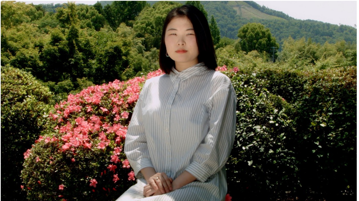
"The most beautiful period in my life" 2018, single channel video with sound