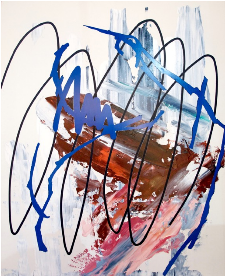
She's Dropping, 2017, acrylic and oil on canvas panel, 803 x 652 mm