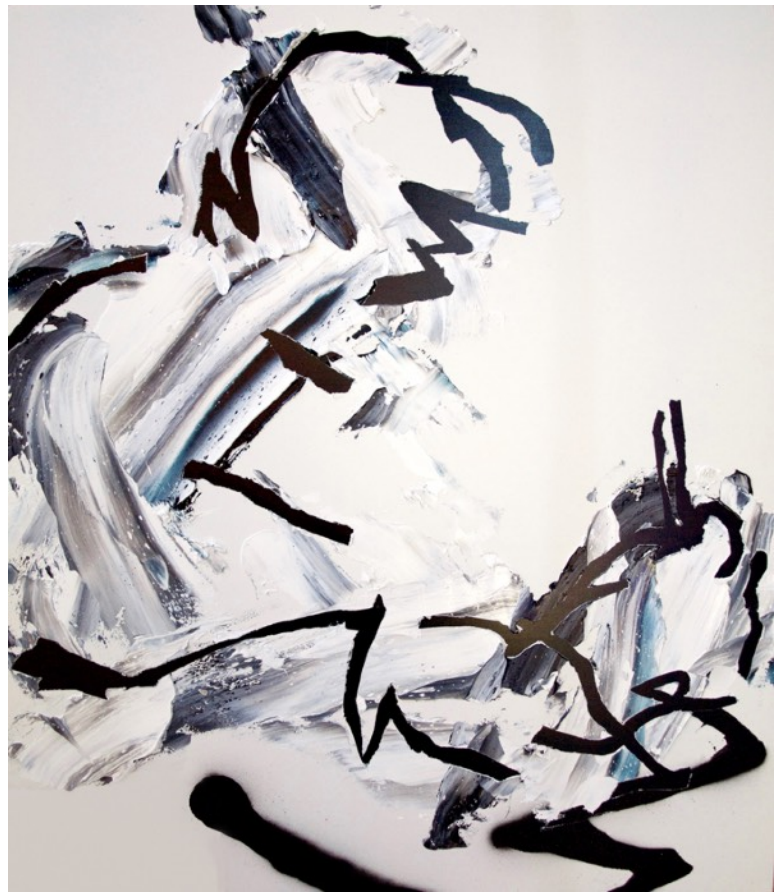
His drawing drawing, 2017, acrylic and oil on canvas panel, 530 x 455 mm