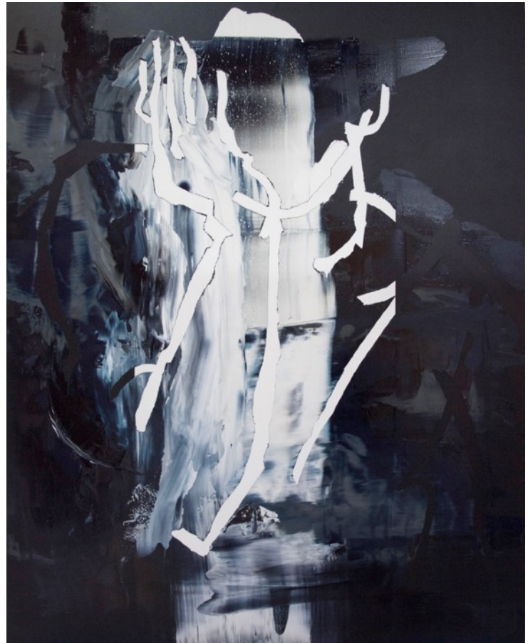
It was impossible to guess whether it meant 'yes' or 'no', 2018 acrylic and oil on canvas panel, 910 x 727 mm