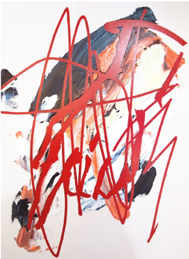
Pointing finger, 2017, acrylic and oil on canvas panel, 333 x 242 mm

Today, “Flat space” is not only on a paper and canvas where we can touch, but also the displays of monitors, smartphone, and tablets and additionally the world appearing in those displays. OKUBO says that “we live in the society surrounded by infinite number of displays. We sometimes confuse our reality with flat space. We might feel as if it had been experienced but it is just a phenomenon in this shallow space. Moreover, we might feel that things and people we meet in our everyday life are to be thin. Our perception keeps wavering between a flat space and an object”. What can we perceive from painting after our perception has been changed dramatically? OKUBO is painting as an act of searching this question.