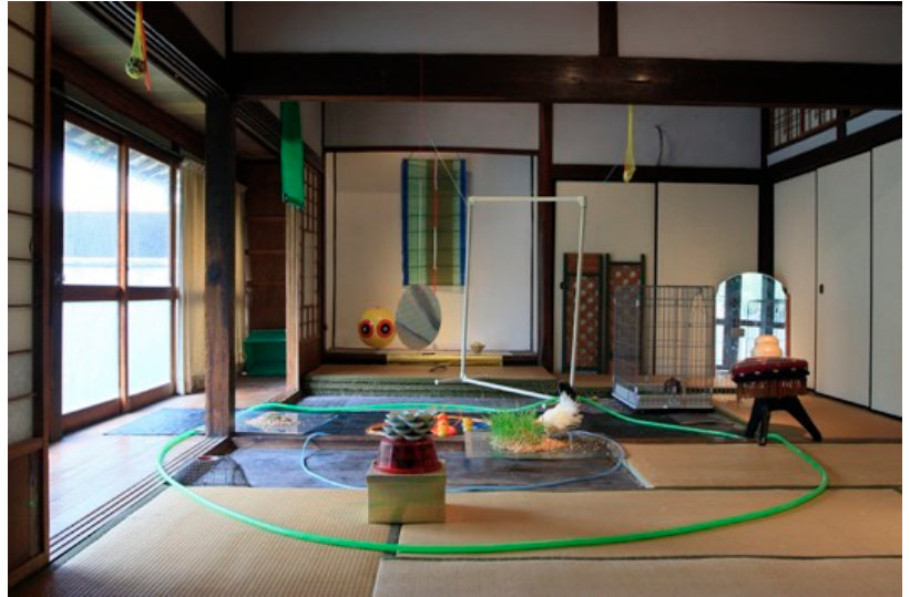
Left : Installation view, "Weeds", 2006, BankART Studio, Yokohama, Japan Photo by Tetsuro Kano, Courtesy of the artist. Right : Installation view, "Respective Garden", 2006, Yamaguchi, Japan Photo by Tetsuro Kano, Courtesy of the artist