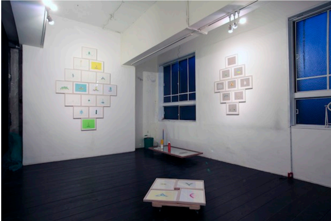
Left : Magical paths, installation view (2010, Akita, projectroom sasao)

*A Green Corridor is an area of habitat connecting wildlife populations separated by human activities (such as roads, development, or logging). This allows an exchange of individuals between populations, which may help prevent the negative effects of inbreeding and reduced genetic diversity (via genetic drift) that often occur within isolated populations. Corridors may also help facilitate the re-establishment of populations that have been reduced or eliminated due to random events (such as fires or disease). This may potentially moderate some of the worst effects of habitat fragmentation.