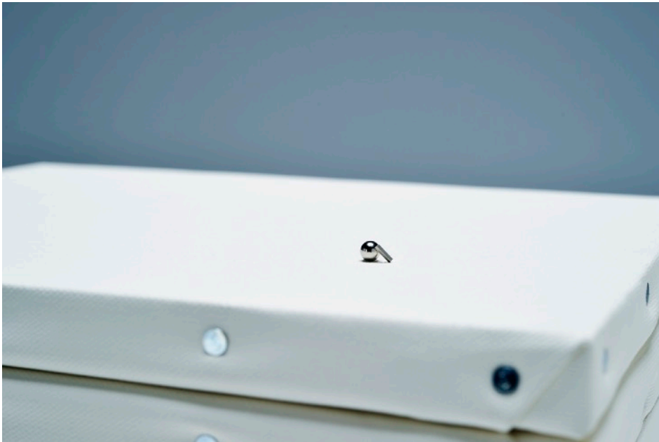
micromotion003, 2013, canvas, clock, magnet, 27.3 x 22 cm

2010 Taishi Kamiya "Spectra of Air" label : HOME NORMAL (n020)