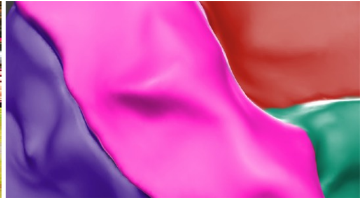
new plane , 2014, JPEG, 1920 x 1080 pixel