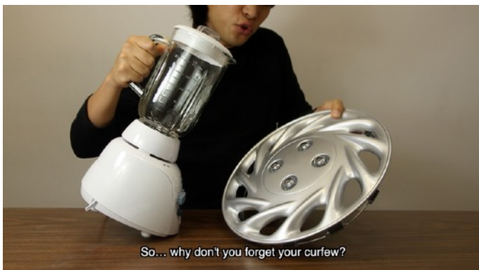
Distance , 2012, Single channel video with sound, 10min.52sec.

Yuko MOHRI was born in 1980 in Kanagawa. She creates installation works from everyday goods and dismantled pieces of objects that sense the power of nature, such as magnetic force, gravity, light, and temperature. Her major solo exhibitions include, “Sauvage-the wilderness within the city” (Art Center Ongoing, 2013,) “Orochi” (waitingroom, 2013,) and “Circus”(The Museum of Contemporary Art Tokyo, Bloomberg Pavillion, 2012.) She has also participated in group exhibitions such as “MEDIA ART/KOITCHEN”(The National Museum of Indonesia, Jakarta, 2013)”, “Art and Music” (Museum of Contemporary Art Tokyo, 2012) and many others in Japan and abroad. Additionally, she has received the Bacon Prize at the “Art Fair Tokyo 2014”. She is also showcasing her work in “Sapporo International Art Festival 2014” and “Yokohama Triennale 2014” in this summer. At this exhibition, she will be presenting the series, “More More Tokyo” that she introduced at Art Fair Tokyo 2014 and her latest edition works that she presented at the group exhibition in Manila. http://mohrizm.net/