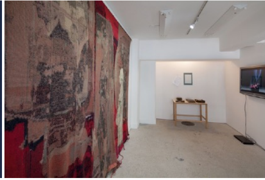
Steam, Smoke, Grace , 2013, mixed media, installation view