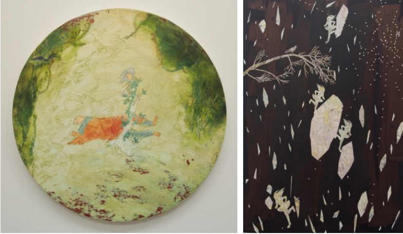
Left: Like a Lylac , 2013, oil and acrylic on panel, 44.5cm in dia.