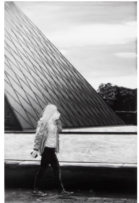
The missing shade 22-2, 2017, gelatin silver print, 79.5 x 52 cm