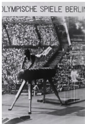
The missing shade 31-1, 2017 gelatin silver print, 194 x 131 cm