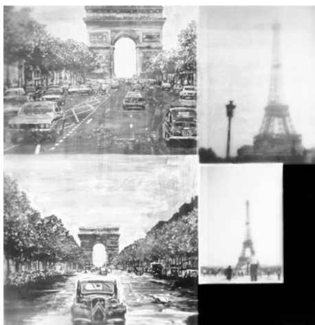
The missing shade 38-1, 2017, gelatin silver print, 76 x 75 cm