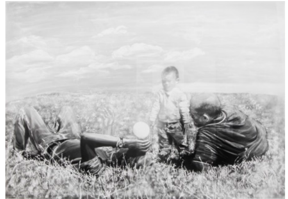
The missing shade 21-2, 2017, gelatin silver print, 71 x 101 cm