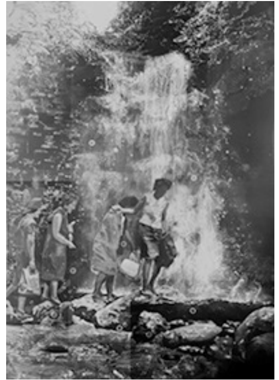
The missing shade 10-1, 2015, gelatin silver print, 194 x 131 cm