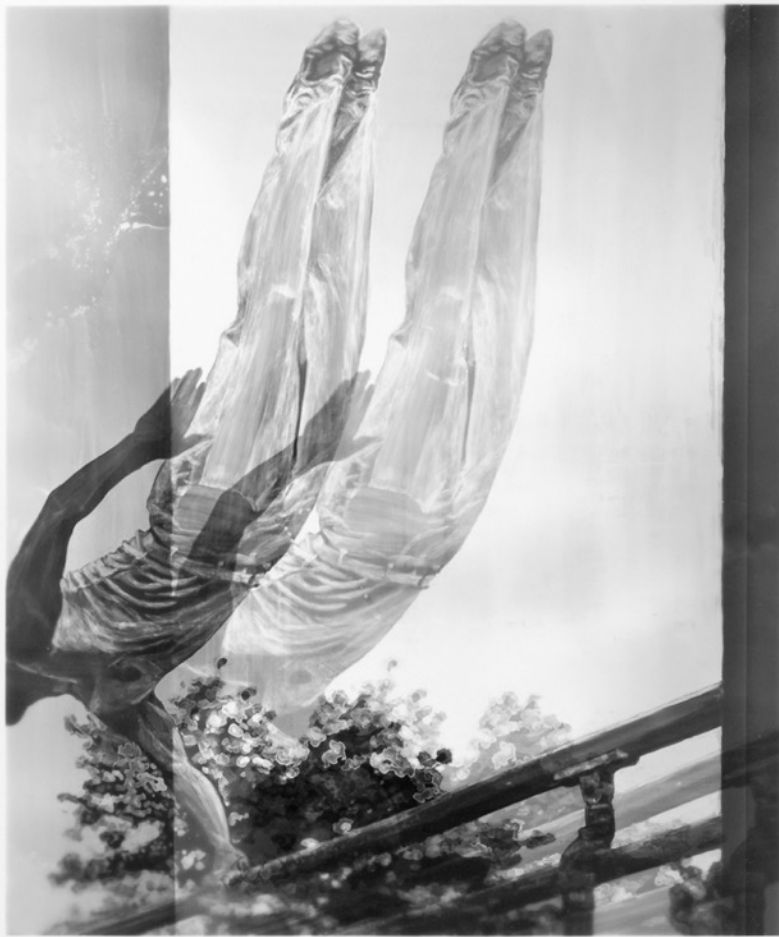
The missing shade 40-2, 2017, gelatin silver print, 572 x 478 mm

Tokyo, Japan - WAITINGROOM is pleased to announce Saori MIYAKE Solo Exhibition, "THE MISSING SHADE 3", which is the artist's solo exhibition for the first time at our gallery. She has been depicting intimate relationship with our surroundings encompassed in the act of viewing images, expressing the stories, fragments, and multilayers of the images through an unique method of photogram based on the found photo. In conjunction with this exhibition, she is also participating in a group exhibition, "20thDOMANI / THE ART OF TOMORROW", at The National Art Center Tokyo (1/13-3/4/2018) and will showcase a group of new works based on the photo albums, scrapbooks, books, and keepsakes of an individual, Mr. Y, at both venues.