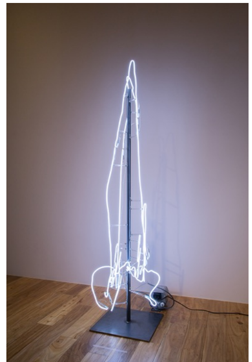
"Do geese see god?" 2015, neon light, w512 x d240 x h1800 mm