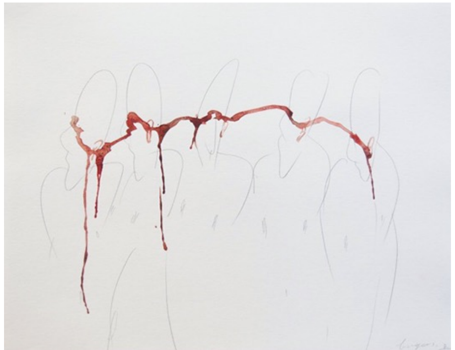
"from the earliest time", 2015, pencil, watercolor on paper, 410 x 320 mm