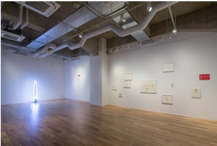
"Collector and Artist : Rikako KAWAUCHI Solo Exhibition" 2015, installation view

artist website : http://rikacocacola.tumblr.com