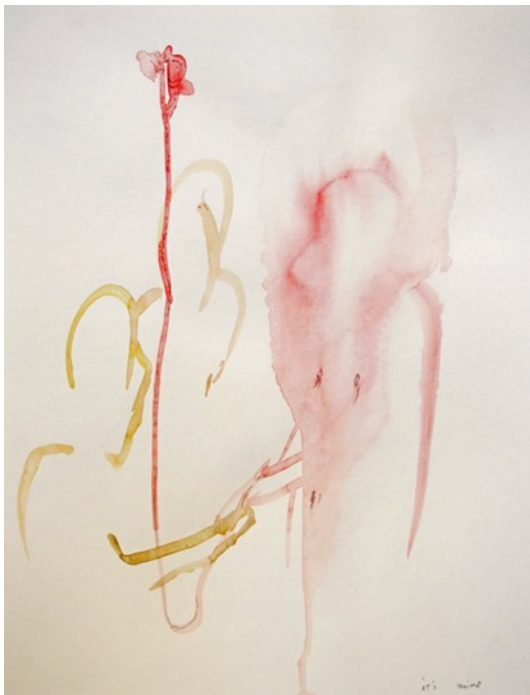
"It's mine", 2015, pencil, watercolor on paper, 410 x 320 mm