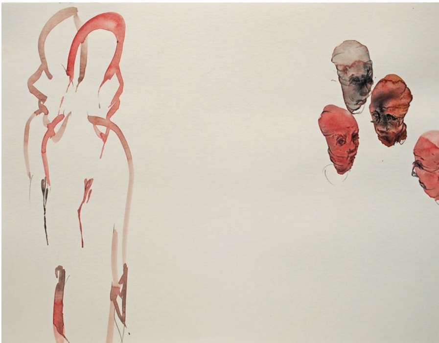
“I realized...”, 2015, pencil, watercolor on paper, 410 x 320 mm

Tokyo, Japan - waitingroom is pleased to announce the first solo exhibition of Rikako Kawauchi at the gallery from December 19th, 2015 to February 7th, 2016 (gallery's winter break starts from December 28th, 2015 to January 7th, 2016). Rikako Kawaguchi uses lines to depict her observation on the meaning of our existence and human relation across various media including drawing, painting, steel wire, rubber tube, neon light etc. Through her works, she showed us how powerful the strength lies in the simple form of a line. Her coming solo exhibition “back is confidential space. Behind=Elevator” will show the new works including twelve drawings, three paintings, two neon works, and several works in steel wire and rubber tube.