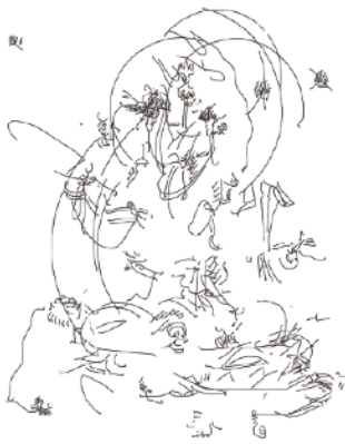
"Sketches for Invisible Knowledge No.6", 2021, ink on paper, framed 520 x 404 mm (image size: 420 x 297 mm)

Born in 1984 in Kanagawa. Graduated from Tama Art University, Graduate School, Department of Design, in 2009. Faculty at Kyoto Seika University.