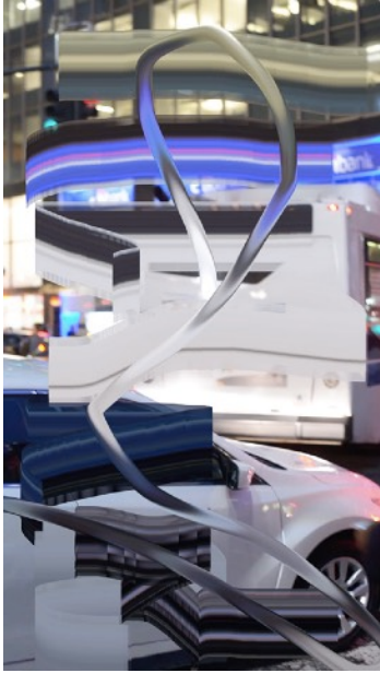
"New York City #smudge #video", 2016, video still