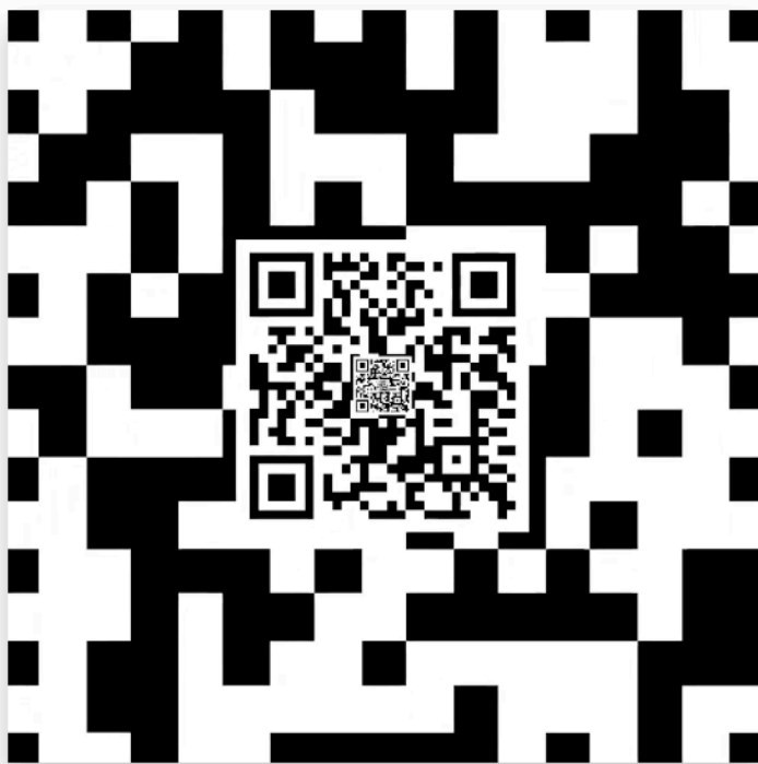
"Crypto Poetry #1", 2021, NFT work, 1080 x 1080 pixels, 54 seconds (seamless loop) *reference work

He also received the Ohara Museum Award at the "VOCA 2018" exhibition (2018, Ueno Royal Museum, Tokyo) .