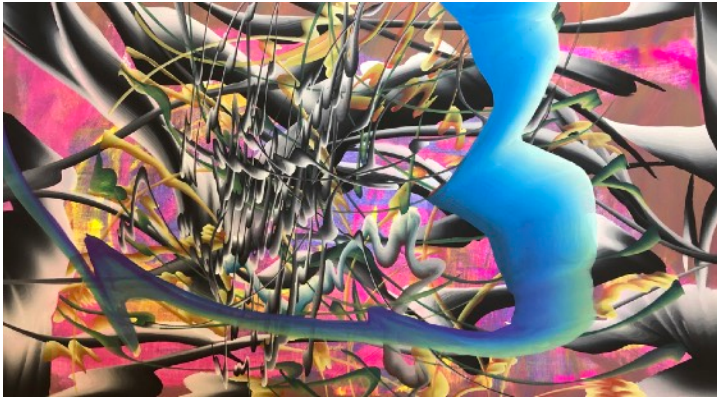
"Limestone Cave (jpeg)", 2021, cotton on panel, gesso, acrylic, 910 x 512 mm