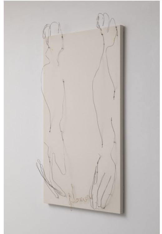
flowers, 2021, wire, pin on panel, 1140 x 605 x 200 mm