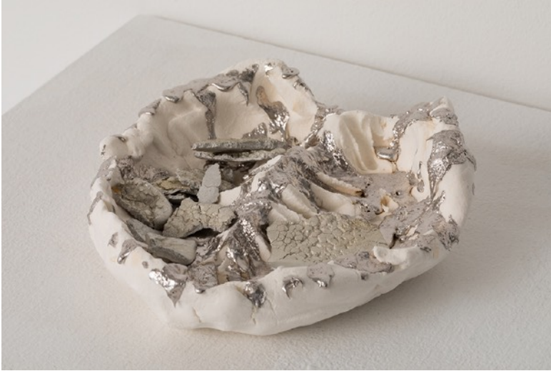
Lung, 2021, clay, metal, 150 x 145 x 50 mm