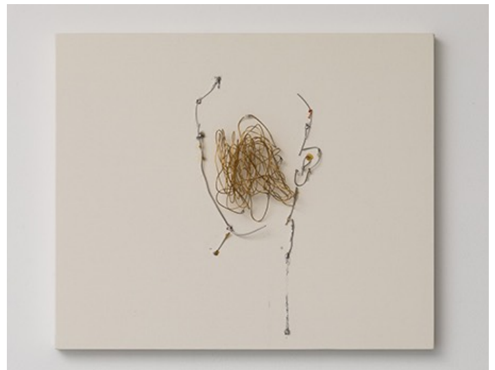
face washing, 2021, wire, pin on panel, 380 x 455 x 75 mm

*Due to the spread of the COVID-19 infection, there is a possibility that the duration of the exhibition and opening hours may be changed. We will announce the latest information on our website and SNS. We thank you for your understanding.