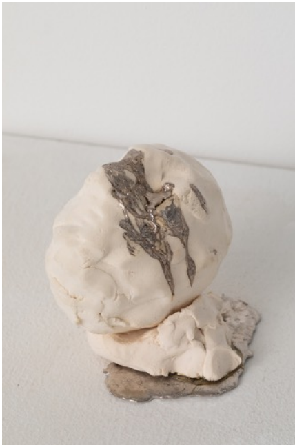
Face, 2021, clay, metal, 95 x 80 x 90 mm