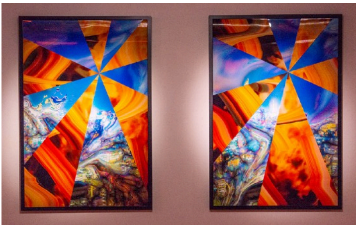
left : "Dual Image ●" right" Dual Image ○" 2021, inkjet print on acrylic, lenticular, wooden frame, 1030 x 691 x 30 mm