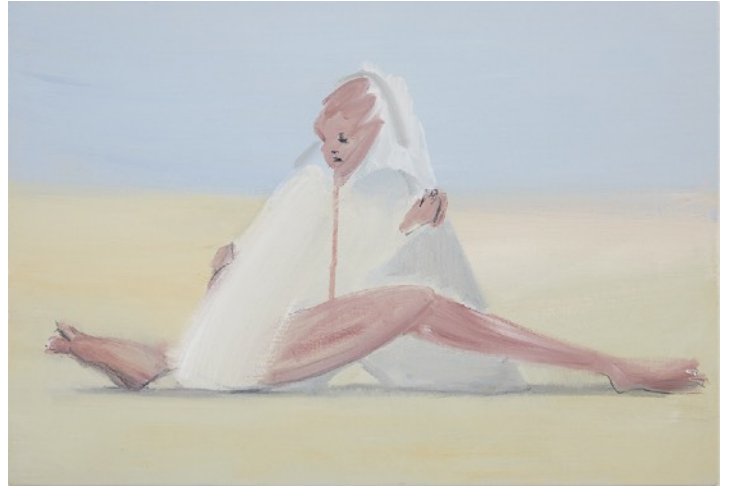
"Equilibrium", 2021, oil and charcoal on canvas, 410 x 605 mm