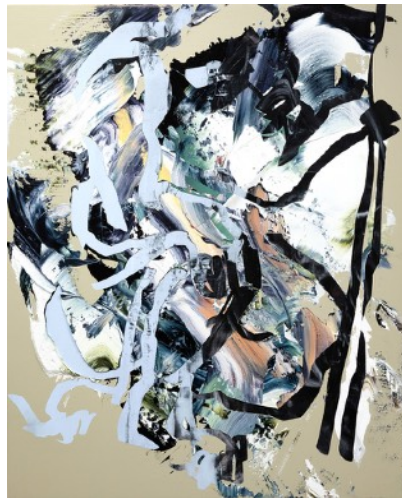
"ambush", 2021, acrylic and oil on canvas panel, H 803mm x W 652mm