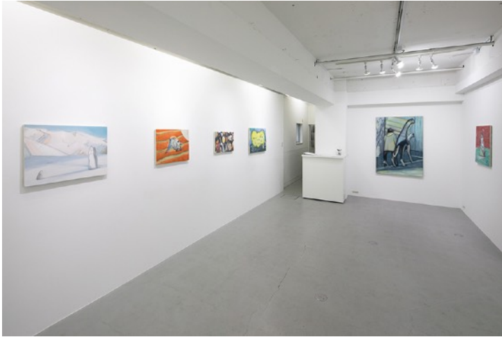
2021 solo exhibition "catch a glimpse" (WAITINGROOM/Tokyo) installation view