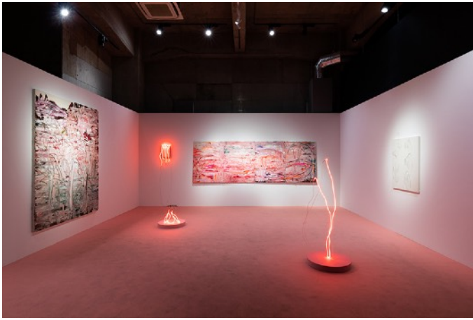
"TERRADA ART AWARD 2021 finalist exhibition", installation view