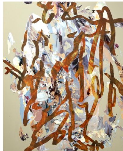
"subjugation", 2021, acrylic and oil on canvas panel, H 803mm x W 652mm