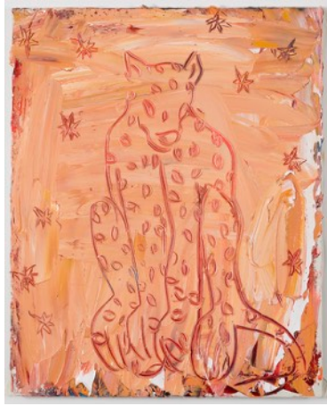
"Tiger, tiger", 2021, oil n canvas, 910 x 727 mm