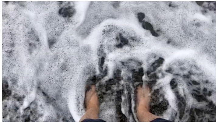
“Time Cannot Go Back (2020-2022)”, 2020-2022, Single channel video with sound

Ushimado Asia Triennale , Setouchi City Museum of Art, Okayama Hairy Soy Source, Soap and Ten Statements for an Artist , MIACA, Hong Kong egØ - Reexamining the Self - , punto, Kyoto