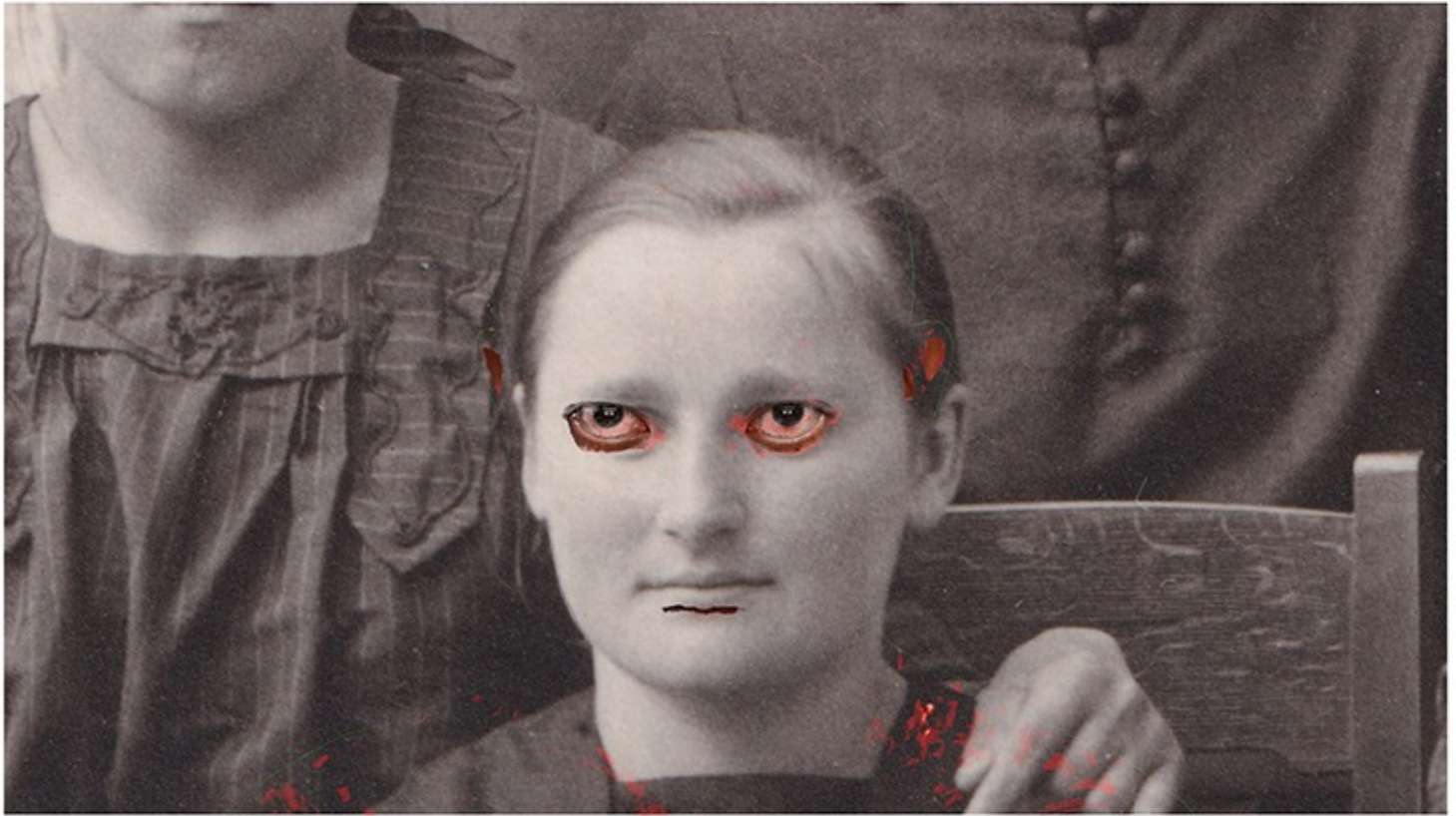
"Human's photographs", 2022, single channel video with sound