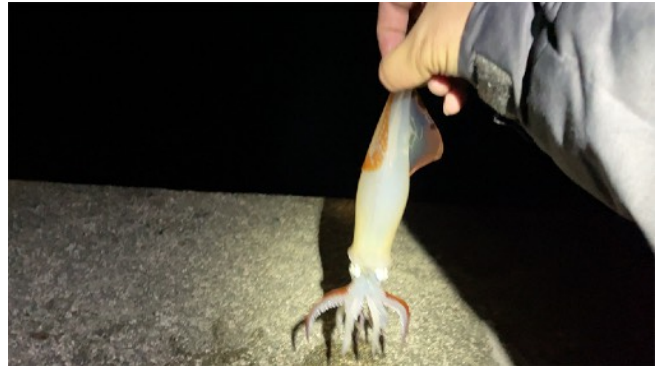
"Time Cannot Go Back (2020-2022)", 2020-2022, Single channel video with sound