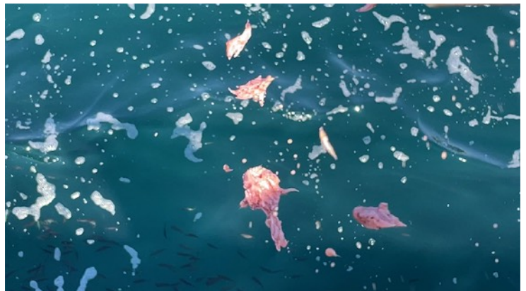
"Time Cannot Go Back (2020-2022)", 2020-2022, Single channel video with sound