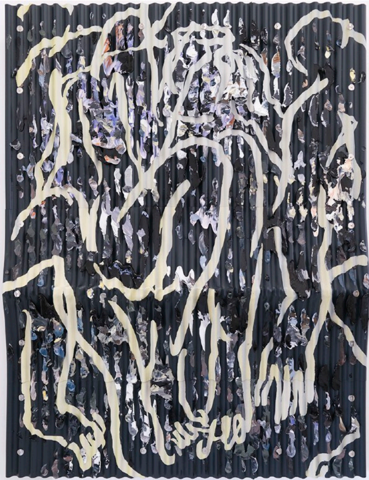
“They”, 2022 acrylic, and oil on corrugated plastics sheeting, H1237×W942mm