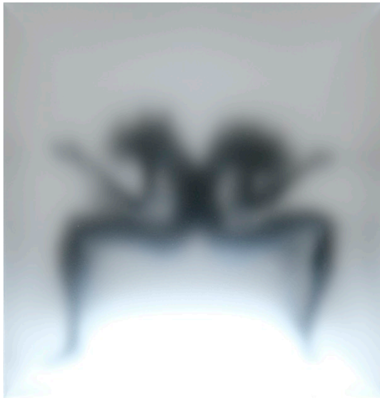
"Two Sorrows" (部分) , 2022, clay, acrylic paint, LED light, acrylic box, steel, H356×W310×D310mm

Tokyo, Japan - WAITINGROOM is pleased to announce Saya Okubo "They", her second solo exhibition at this gallery in two years. Okubo describes her work as "the act of exploring the existence and existence of things and people in two-dimensional space," and creates paintings that coexist with two separate elements: symbolic images expressed as outlines, and phenomenal swells of images with a sense of materiality. The motifs represented by the contour lines are based on Okubo's daily drawings of various parts of the human body and the various poses that humans perform on a daily basis. In this exhibition, the artist will present approximately 15 new paintings, including a new series called "They," which combines multiple human parts and poses in one image, painted on corrugated plastic sheets.