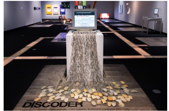
Solo exhibition "UN-DEAD-LINK" installation view (Tokyo Photographic Art Museum, Tokyo, 2020)

SonarSound Extra , Ebisu Garden Place, Tokyo, Japan Nam June Paik Award 2004 , Phoenixhalle, Dortmund, Germany Reactivity: unpredictable past , NTT Intercommunication Center [ICC], Tokyo, Japan Tokyo Style in Stockholm , Beckmans School of Design, Stockholm, Sweden Navigator , National Taiwan Museum of Fine Arts, Taichung, Taiwan n_ext: New Generation of Media Artists , NTT Intercommunication Center, Tokyo, Japan Mediarena: contemporary art from Japan , Govett-Brewster Art Gallery, New Plymouth, New Zealand Roppongi Crossing: New Visions in Contemporary Japanese Art 2004 , Mori Art Museum, Tokyo, Japan SHIDA TEN , nou LABORATORY, Tokyo, Japan