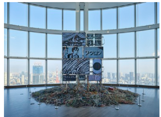
Group exhibition "Kazuo Umezaki The Great Art Exhibition" installation view (TOKYO CITY VIEW, Tokyo, 2022)