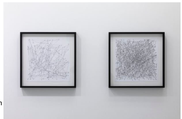
Solo exhibition " CONNECT THE RANDOM DOTS " installation view (WAITINGROOM, Tokyo, 2021)