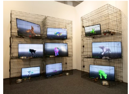
"Metaverse Petshop", 2022, installation view Supported by NowHere | NFT advisor Toshi / wildmous

Media City Seoul , Seoul Museum of Art, Seoul, Korea Yebisu International Festival for Art & Alternative Visions , Tokyo Photographic Art Museum, Tokyo, Japan [Internet Art Future↔] - Reality In Post Internet Era , NTT Intercommunication Center [ICC], Tokyo, Japan