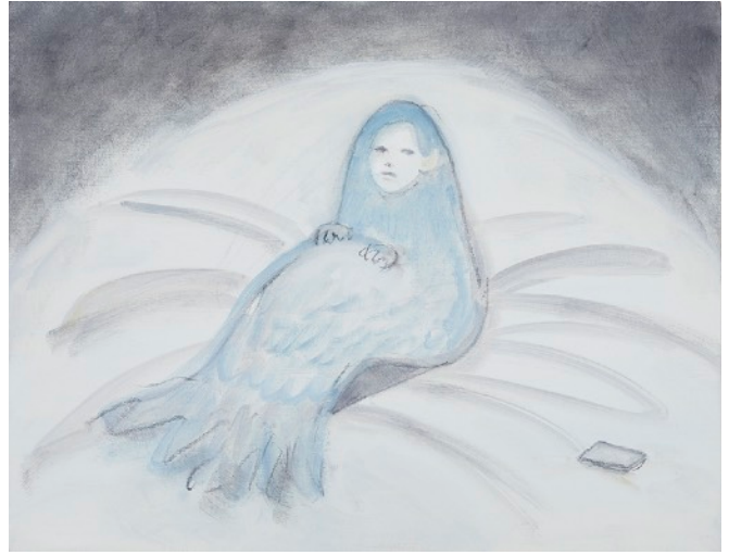
"bed bug", 2023, oil and charcoal on canvas, H 410 x W 530 mm