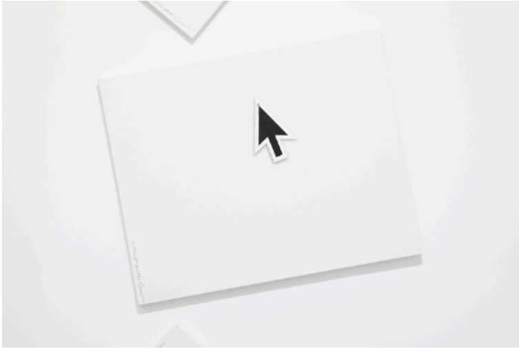
"Click and Hold: x377px, y931px, 67dpi", 2019, acrylic, pencil and nails on canvas, H609 x W762 mm