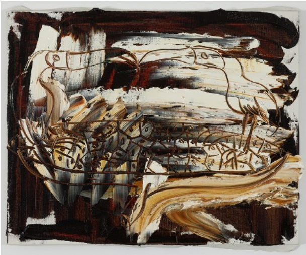
"making honey" 2023, oil on canvas, 910 x 727 mm