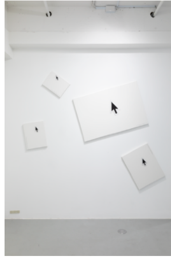
Solo exhibition "LO" 2019 (WAITINGROOM, Tokyo) installation view