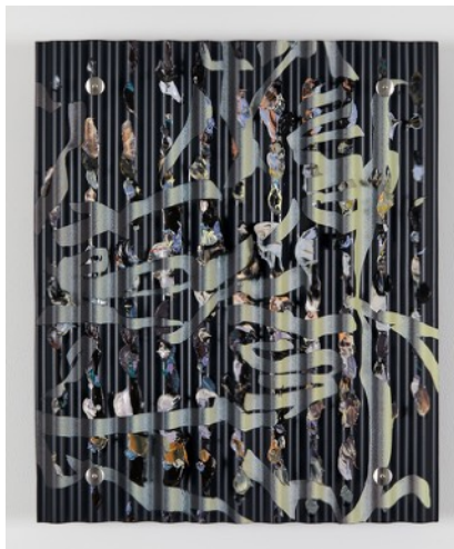
Left: "They", 2023, acrylic and oil on corrugated plastics sheeting, H 505 x W 410 mm Right: "They", 2023, acrylic and oil on corrugated plastics sheeting, H 425 x W 355 mm