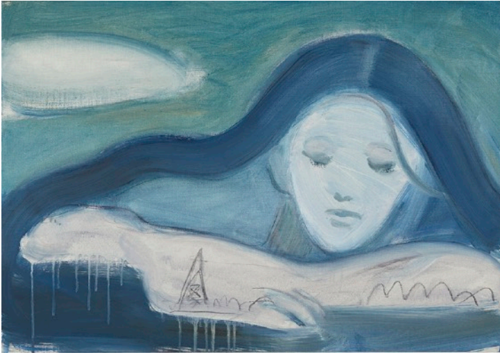
"Gazing at", 2023, oil and charcoal on canvas, H 455 x W 652 mm