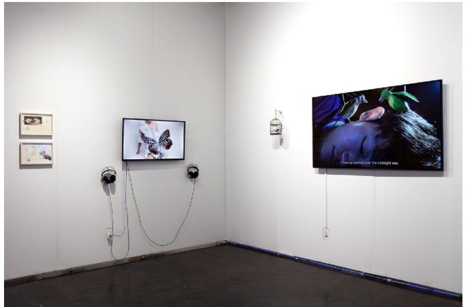
Art Fair "NADA Miami 2022" (Ice Palace Studio, Miami) installation view