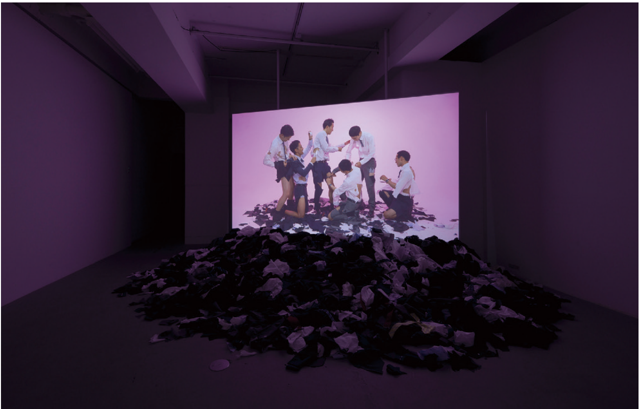
“Cut Suits” 2023 installation view

Evocative of myths, legends, fairy tales, and other fantasy worlds, Takata creates vibrantly rich narratives through his self-produced cinematic pieces. Deceptively simple and often profoundly humorous, he meticulously crafts each vignette, often transforming his tiny apartment into elaborate homemade film sets while sculpting his own intricate and colorful props, which are themselves works of art. Directing, filming, narrating, and even acting in his videos, he is a visual storyteller whose elaborate visions playfully interrogate social questions around power, nation, gender, and sexuality. Resonating with subtle and often poetic critique, these works are theatrical, poignant glimpses into alternate universes that challenge our understandings of contemporary society in Japan and worldwide.