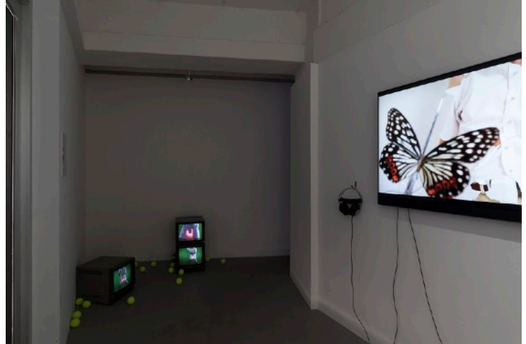
Solo Exhibition "Cut Pieces" (WAITINGROOM, Tokyo) installation view

2023 Cut Pieces , WAITINGROOM, Tokyo, Japan 2021 LOVE PHANTOM 2 , WAITINGROOM, Tokyo, Japan 2019 MAM Screen011: Takata Fuyuhiko , MORI ART MUSEUM, Tokyo, Japan 2018 Dream Catcher , Alternative Space CORE, Hiroshima, Japan 2017 LOVE PHANTOM , Art Center Ongoing, Tokyo, Japan 2016 STORYTELLING , Kodama Gallery, Tokyo, Japan 2014 MY FANTASIA II , Art Center Ongoing, Tokyo, Japan 2013 MY FANTASIA , Kodama Gallery, Kyoto, Japan 2012 VENUS ANAL TRAP , Art Center Ongoing, Tokyo, Japan