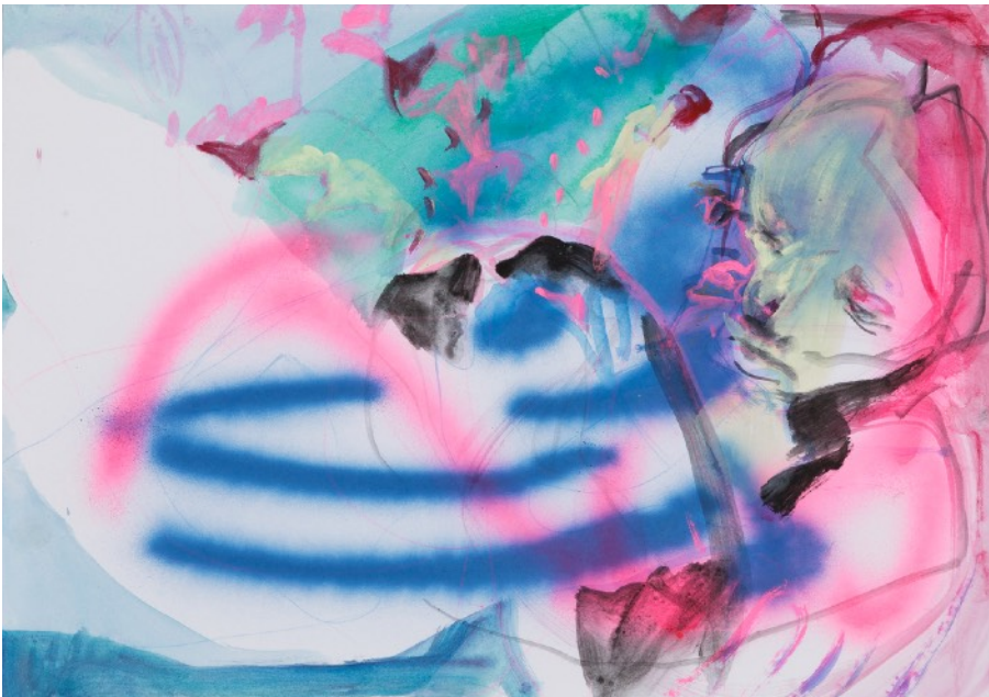
"202007", 2020, 537 x 380 mm

Tsuchitori has been creating paintings with the motif of two people in an intimate relationship or two separate entities within a single person, as if they were melting into each other. These paintings, which can be broadly categorized into two series, "I and You" and "a scene," express a dense atmosphere in which subject and object are mixed up, and all borders are blurred. For Tsuchitori, drawings are a familiar media, with a different scope from paintings. In her prolific drawings, we can see how images are captured even more instantaneously than in her paintings. The drawings that Tsuchitori has been experimenting with and accumulating on a daily basis are not merely studies for paintings: they are fascinating as autonomous works that might be described as another kind of tableau. This is the first book of drawings by Tsuchitori in her career that offers a glimpse into the source material and inspiration for her paintings. We hope you will enjoy the book as well as the exhibitions.