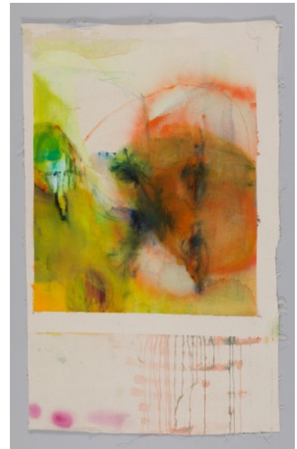
"202206", 2022, 959 x 597 mm