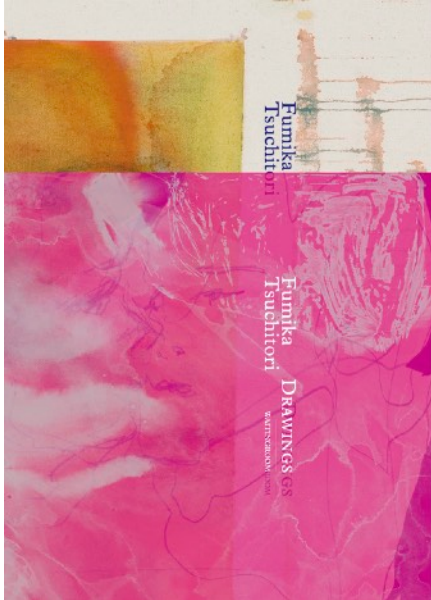
Image of book cover