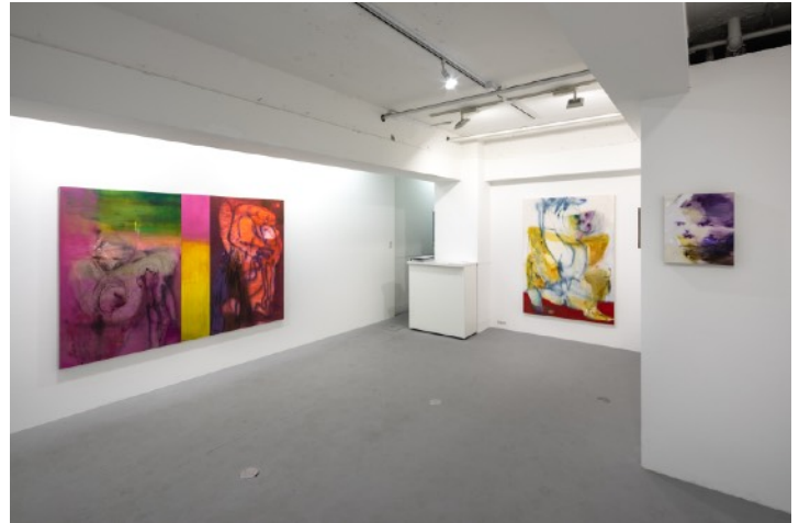
Solo Exhibition "Sleeping with me holding in my arms, Silence" (2023) Installation view (WAITINGROOM, Tokyo)