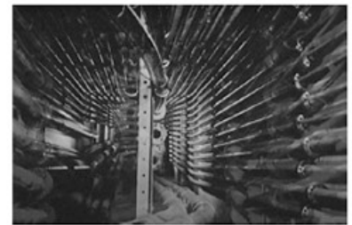
A labyrinth of metal pipes installed underground in Paris

This is why none of these works are straight photographs.