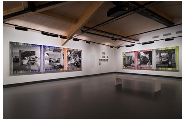
Solo Exhibition "La clairvoyance du hasard" 2022, installation view Centre de la Photographie de Mougins, France