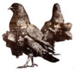
Pigeon with camera / pigeon photographer