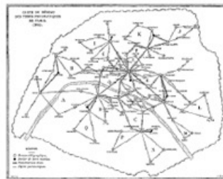
Pneumatic post (La poste pneumatique) Network

This time, I created a parcours of my own design and took photographs as I moved along it. I did not take tourist photos of Paris that deviate from this circuit. Neither did I want to make a realistic documentary of this act, however. Instead of taking pictures of one street or another, I used the scenery that revealed itself when I stood somewhere along the parcours as a kind of springboard. Sometimes, as in a novel, I found myself desiring transcendence so badly that the viewpoint of the subject suddenly became that of a bird, or an intricately entangled underground tube.