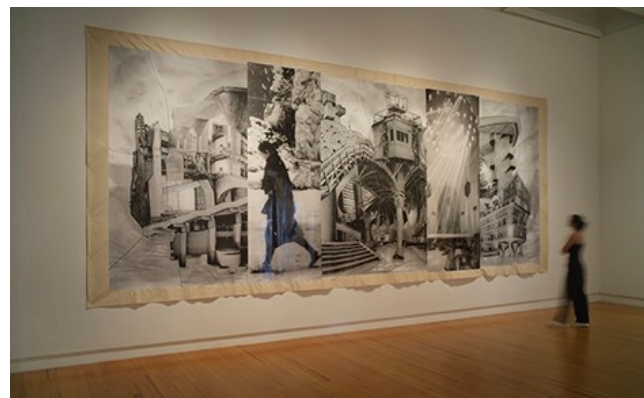
Group Exhibition "Focus" 2024, installation view Maui Arts & Cultural Center, Hawaii, USA