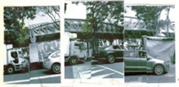
From Yuki Onodera's Esquisse