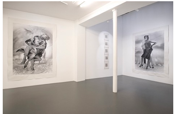
Solo Exhibition "IMPROMPTUS" 2017, installation view Pierre-Yves Caër Gallery, Paris, France

Musée National d'Art Moderne, Centre Pompidou Fonds National d'Art Contemporain, Paris Fonds Municipal d'Art Contemporain, Paris Musée Nicéphore Niépce, France Bibliothèque Nationale de France Huis Marseille, Museum for Photography, Amsterdam The Museum of Fine Arts, Houston, Texas, U.S.A. San Francisco Museum of Modern Art, California, U.S.A. The J. Paul Getty Museum, Los Angeles, U.S.A. The Peabody Essex Museum (PEM) of Salem, Massachusetts, USA. La ville de Dudelange / Centre d'art Nei Liicht, Dudelange. Luxembourg Fondation Daniel et Florence Guerlain, France Fondation Daniel et Florence Guerlain, France Shanghai Art Museum Three Shadows photography Art centre, Beijing The Museum of Photography, Seoul The National Museum of Modern Art, Tokyo, Japan Tokyo Photographic Art Museum (Tokyo Metropolitan Museum of Photography), Tokyo The National Museum of Art, Osaka, Japan Tochigi Prefectural Museum of Fine Arts, Utsunomiya, Japan The Museum of Modern Art, Gunma, Japan Aichi Prefectural Museum of Art, Aichi, Japan Japan Foundation Kawasaki City Museum, Japan Kuwazawa Design School, Tokyo Tokyo Institute of Polytechnics, Tokyo Higashikawa, Hokkaido, Japan Tokyo Opera City Art Gallery The Amana Collection, Japan