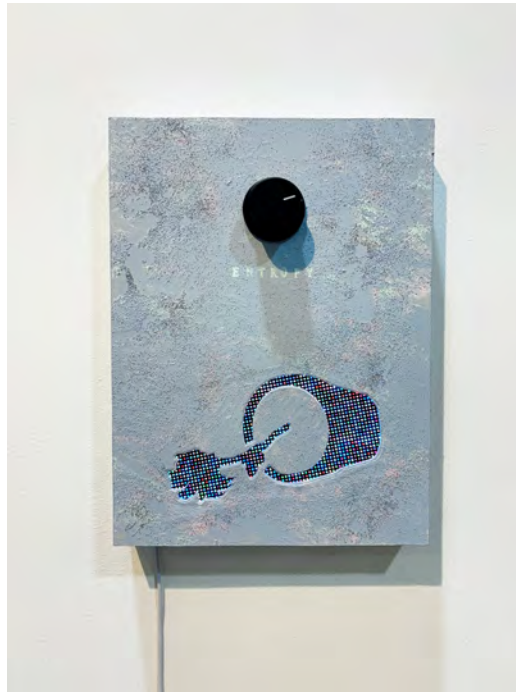
ENTROPY, 2026, Mixed media, w230 × h300 × d40 mm