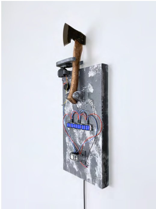
Hatch/et, 2026, Mixed media, w250 × h700 × d40 mm

WAITINGROOM (Tokyo) is pleased to present “RandoMe,” a solo exhibition by exonemo, on view from Saturday, June 6 to Sunday, July 5, 2026. This will be exonemo’s first solo presentation at the gallery in nearly three years. The title “RandoMe” is a neologism combining “Random,” “Me,” and “Rando,” a slang term meaning “a random person.” As the title suggests, the exhibition explores “randomness” through a selection of recent works, including a new installation. Each work visualizes different forms of randomness, varying in both its mode of expression and the entities it involves. In giving form to randomness, the works simultaneously reveal the irreplaceability of each individual. “Being random,” “being oneself,” and “being someone unknown.” These uncertainties intertwine and unfold throughout the exhibition space.